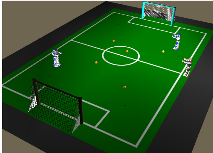
Figure 1: An illustration of an example “Any ball” Challenge scenario.

The robot will start from the intersection of one of the side lines and the center line, facing towards the center of the field. The balls will be placed randomly within an imaginary 3m \times 2m area (i.e. 1/4^{th} of the field) located at the center of the field. Also there will be two stationary robots on the field placed in such a way that they are not somewhere between the balls and the goals. The purpose of placing those extra robots on the field is to make sure that there are some non-ball objects on the field. An example scenario is illustrated in Figure 1.